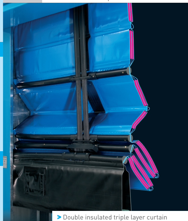
> Double insulated triple layer curtain