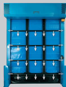
> Seals and handles pressure differences

The C FREEZER 2 has a flexible triple layer curtain with integrated air mattress ( U = 1,97 \text{ W/m}^2 \cdot \text{K} ) to reduce conductive temperature loss through the curtain. The sides of the curtain have additional sealing lips for an enhanced peripheral closing in the vertical side guides. Thanks to this design, no additional sliding door is required for overnight closing.